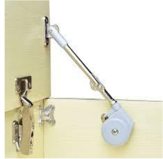
Morinbo Lid Stay