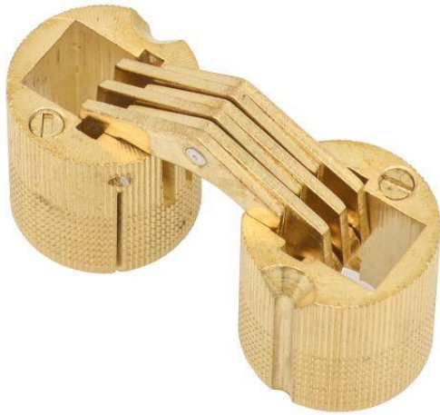
SOSS Barrel Hinge